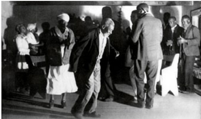
A Gullah dance called the ring shout in Georgia in the 1930s. Turner looked for African-Muslim elements among the Gullah.

the culture and language of their enslaved ancestors, which had long been believed lost.